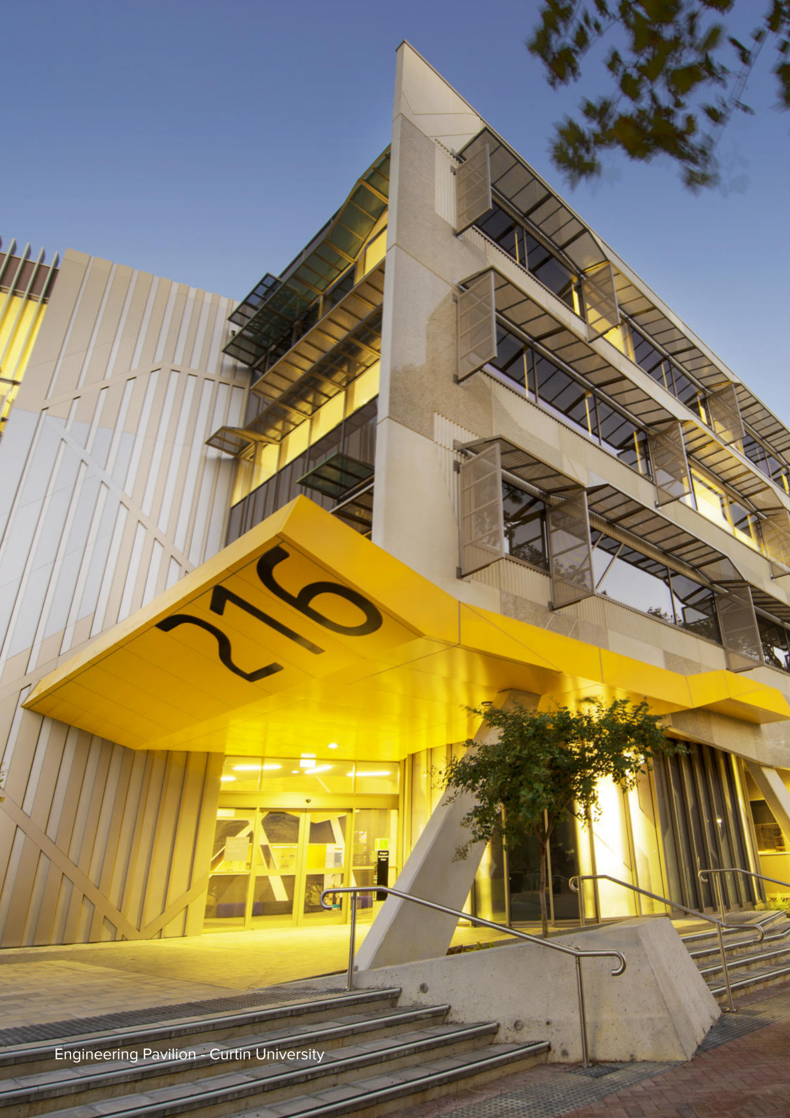
Engineering Pavilion - Curtin University